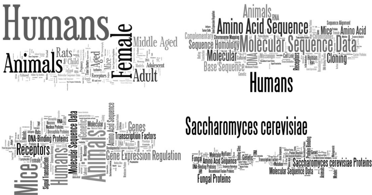
Figure 3 Word cloud ( http://www.wordle.net/create ) representations of MeSH terms found in each corpus: Ab3P (top left), BIOADI (top right), MEDSTRACT (bottom left) and Schwartz and Hearst (bottom right). The MeSH terms confirm each corpus' original intent: Ab3P was intended as a representation of all biomedical literature in PubMed, BIOADI is the corpus used in the BioCreative II gene normalization challenge, half of MEDSTRACT documents were a result of the search term 'gene' on MEDLINE restricted to a small group of biomedical journals and Schwartz and Hearst was a selection of documents returned as a result of the search term 'yeast' applied to PubMed.